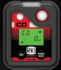
Single Gas Clip on