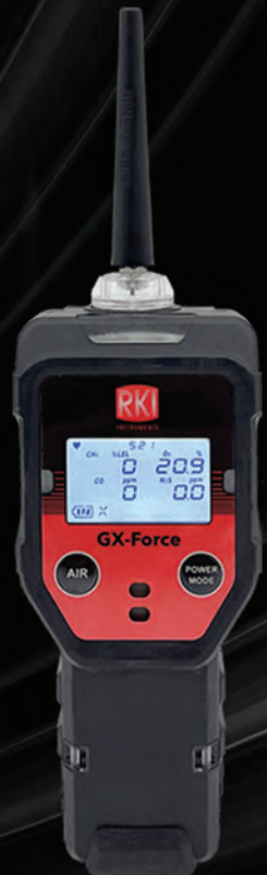
Confined Space with Internal Pump