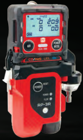
Attachable Sample Draw RP-3R