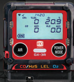
Smallest & Lightest 4 Gas Monitor