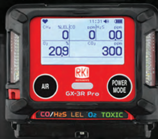
Confined Space with Connected Worker