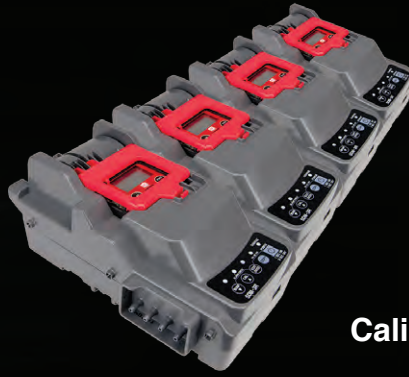
Calibration Stations SDM-3R