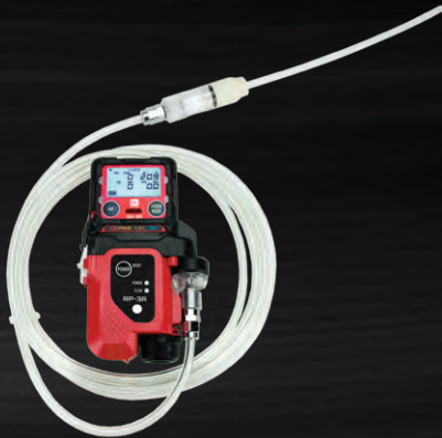
With Hose and Probe RP-3R