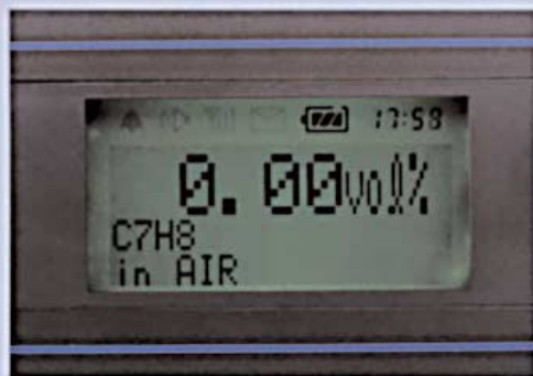
TYPE-01 For solvent gas (vol%)