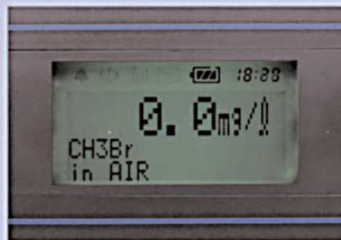
TYPE-03 For fumigation gas